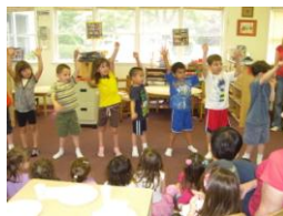
June dance show rehearsal

Dance Show will be on Friday, August 12, 2011 at 4:30 pm.