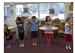
June dance show rehearsal

Dance Show will be on Friday, August 12, 2011 at 4:30 pm.