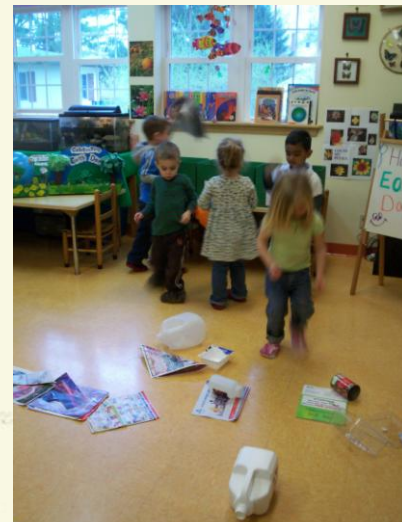
Cleaning up our environment