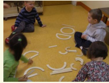
Creating letters with wooden shapes

The children were also encouraged to share ideas about the correct ways to cope with anger and appropriate ways to calm down. They came up with some wonderful ideas, such as walking away, taking deep breaths, drawing a picture, talking about it with someone or even taking a walk! Being given the opportunity to explore the concept of feelings also enabled the children to understand that feelings change. We can feel happy, sad, angry, surprised, scared, worried, excited, tired, etc. Discovering all these different emotions and sharing ideas with one another generated new ideas and we all learned from each other.