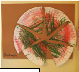
Pizza cut in sixths

During the month of March we continued working on fractions and fraction art. Our pre-k groups were asked to fold a circle in half. They found that the circle was divided into two parts, and then they folded the circle in half again. They discovered how the circle was made up of four parts. Finally, they were asked to fold their circles one last time. This time, they unfolded the circle and saw that there were eight parts in their circle. They then cut out the eight parts of their circles. With these eight sections they created their own "fraction art"—a fraction mouse, fraction pizza, fraction snake, and fraction dog, for example.