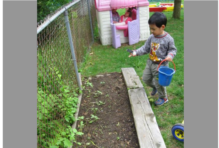
Tending our garden at The Seed